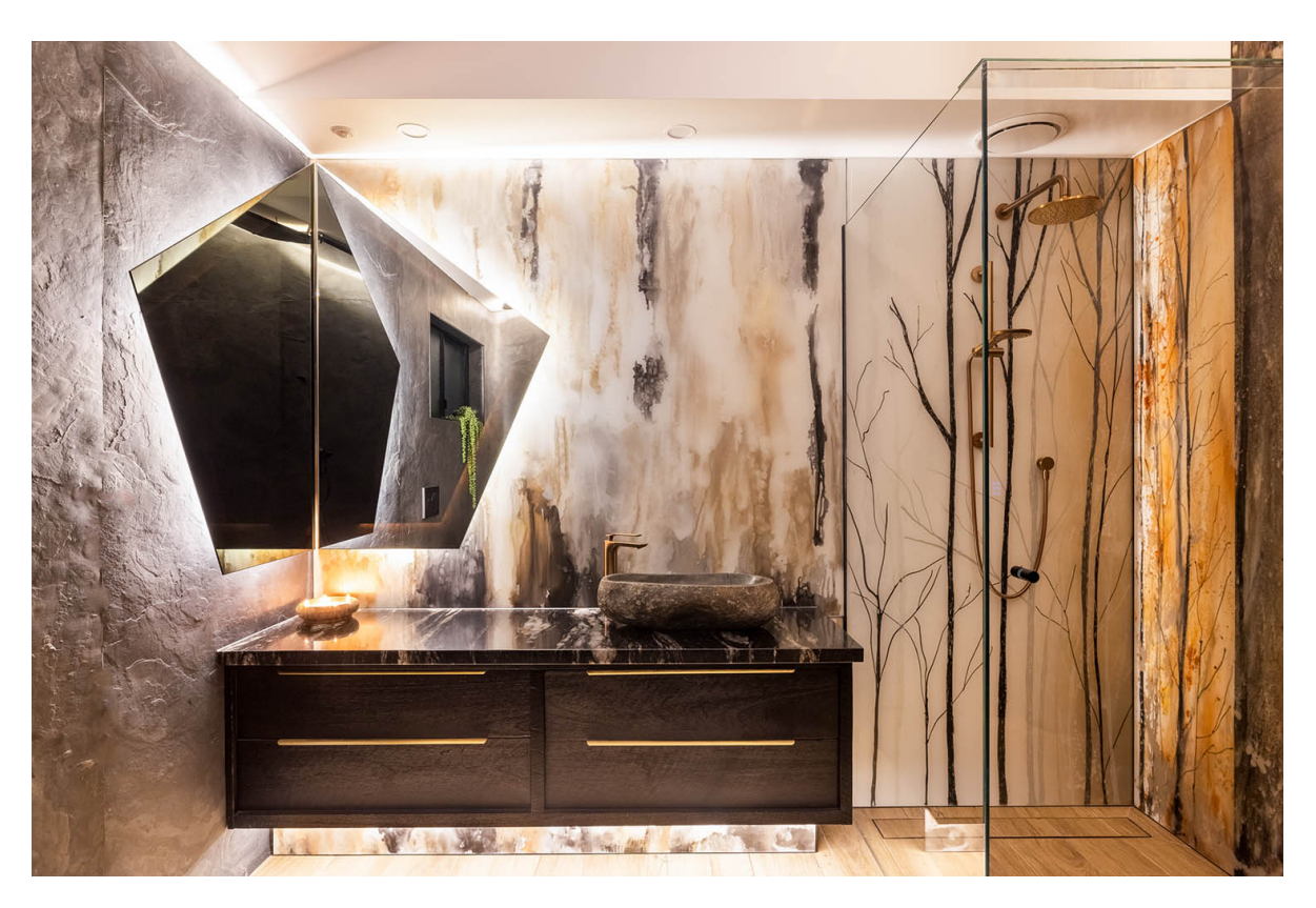
'Nordic Forest' Design by Lisa de Boer - Featuring floor to ceiling low iron, acid etched, handpainted glass panels – illuminated.